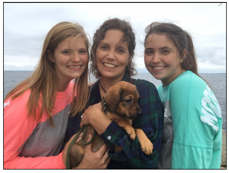
We are so happy to have Courage with us!