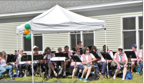
Thank you to the Midcoast Community Band for helping us celebrate with great music!